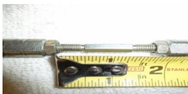
Shift Rod Adj. for 2010 - 2013 RT